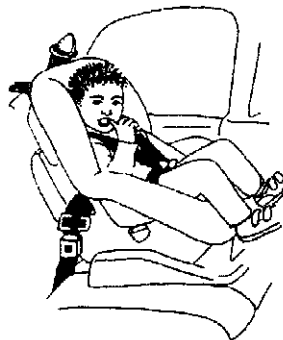
Convertible- harness Forward facing 20 lbs to 80 lbs age 1 and over