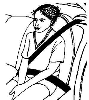
Correct seat belt fit snug on upper thigh belt on center of shoulder