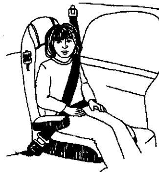
Booster Seat Lap/ Shoulder belt 40 lbs to 100 lbs ages 4 to 8 years old