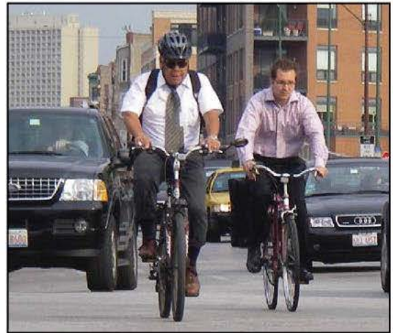
Bicyclists are permitted on all streets in Chicago, with or without bike lanes (MCC 9-52-020)