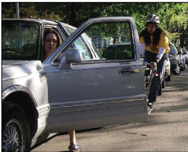
Motorists must look for approaching cyclists before opening vehicle doors (MCC 9-80-35)