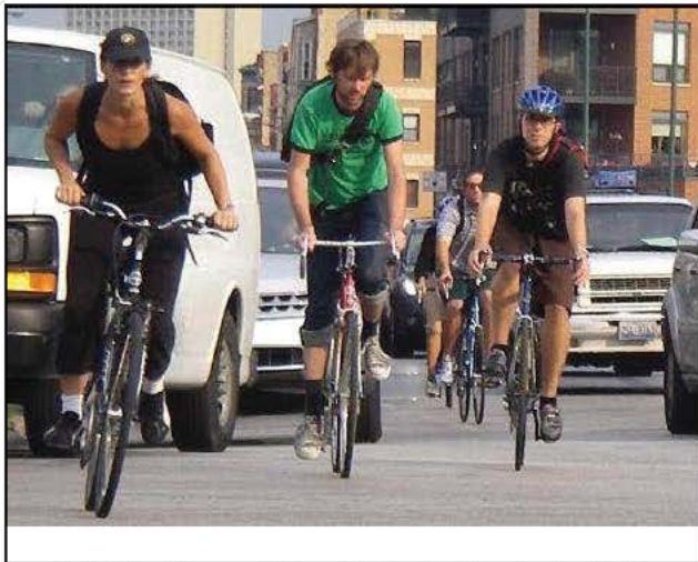
Adult bicyclists must ride on the street with motorized traffic (MCC 9-52-020).

The City of Chicago is committed to making our City the most bicycle-friendly city in the United States. Mayor Emanuel encourages people to bike for transportation and has called for 100 miles of protected bike lanes during his first term. With more cyclists on Chicago's streets than ever before, some are biking for the first time in many years and don't know that the rules of the road apply to them. Meanwhile, many drivers are not used to seeing cyclists on the road, and are not aware of cyclists' rights on city streets.